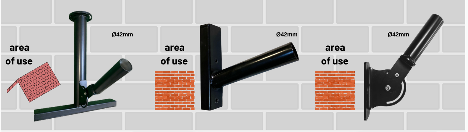
■ Y.A. 145052